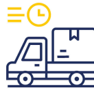
Improvement in on-time delivery