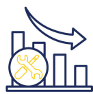
Reduction in capital investment in equipment