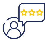
Increased customer satisfaction