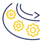
Improved logistics system performance