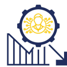
Reduction in investment in information technology