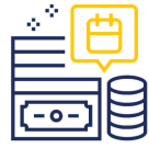
Improvement in inventory turnover rates